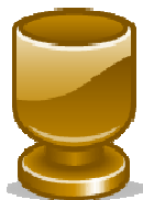
kikombe cha umoja