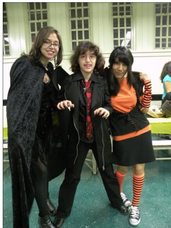
Revelers scare up a ghost at the Boo Bash Halloween Dance.