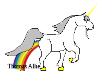
This is my end result of the unicorn placing in it the rainbow and my name.