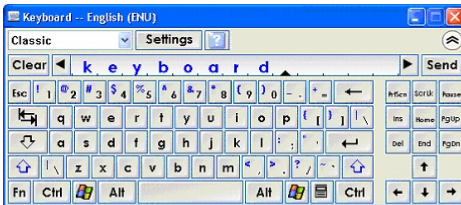
On-Screen Keyboard with Preview Pane open