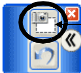
Area Capture button